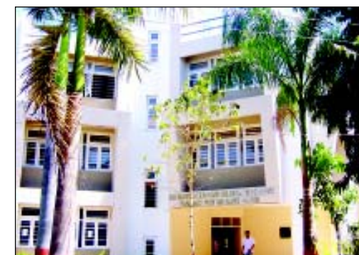
Post Graduate Building