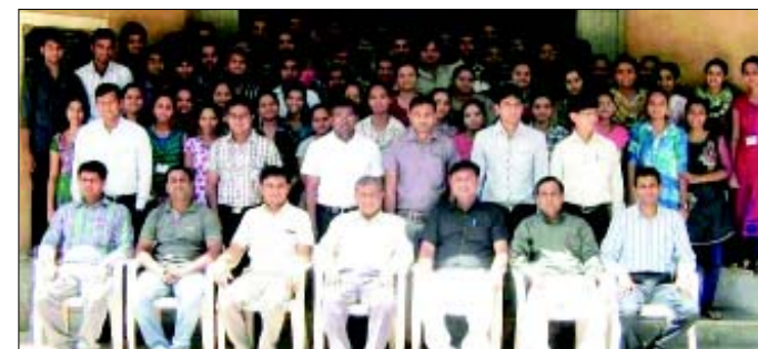
FINAL B.PHARM GROUP