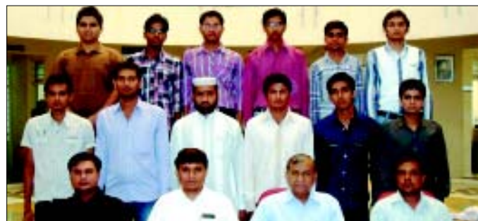
M.PHARM - INDUSTRIAL PHARMACY GROUP