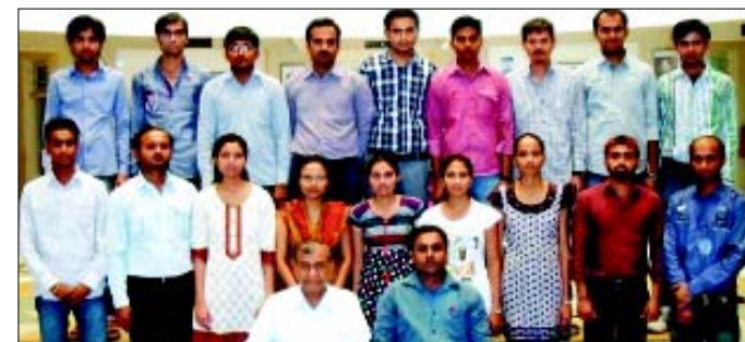
M.PHARM - PHARMACEUTICAL ANALYSIS GROUP