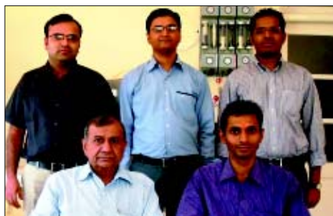
M.PHARM - PHARMACOGNOSY GROUP