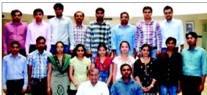
M.PHARM - QUALITY ASSURANCE GROUP