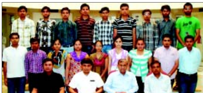
M.PHARM - PHARMACEUTICS GROUP