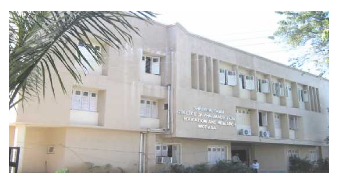
M. Pharm. Building