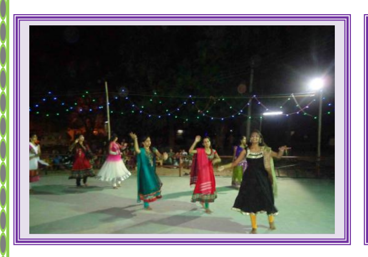
Sarad Purnima "Ras Garba"