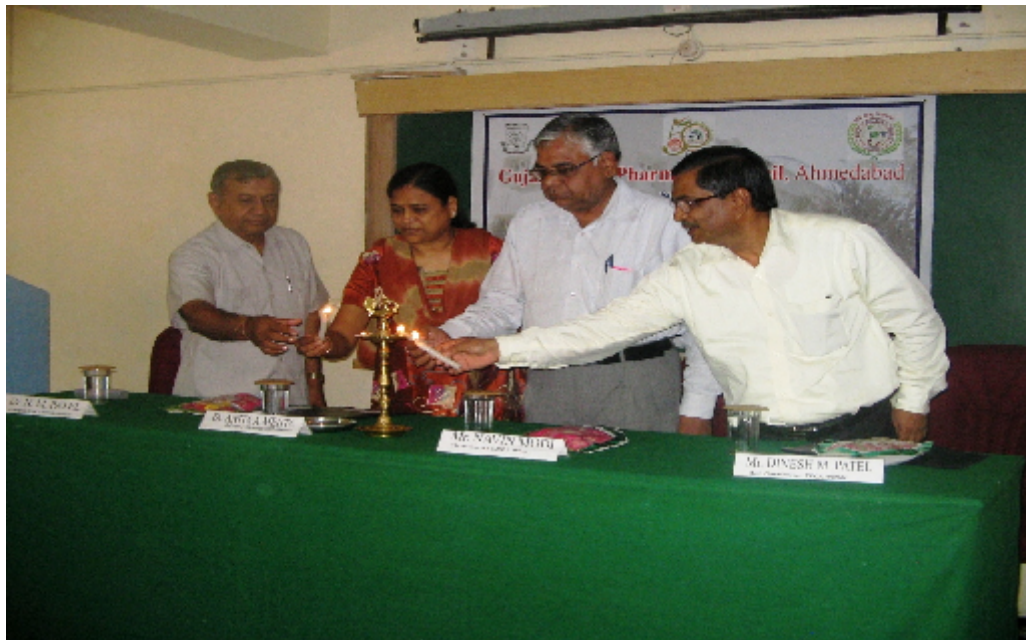
Lighting Lamp in Inaugural Function