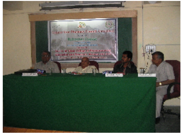
Valedictory Function (Guests)