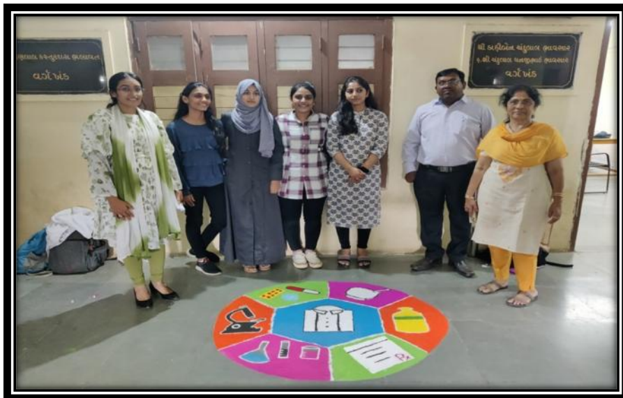
Students Winning Second Rank in Rangoli Competition